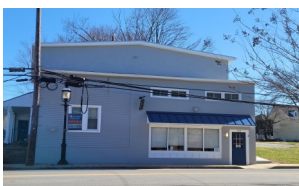
148 E. King Street

As you drive down King Street you will notice numerous buildings receiving a makeover: