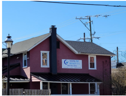
232 E King Street

Economic revitalization has become a priority for the businesses located in the Commercial Zoning Districts in Malvern Borough, as well as the Community that frequents such. Borough Council has committed to holding events throughout the year to bring foot traffic to local businesses and brand Malvern for their events.