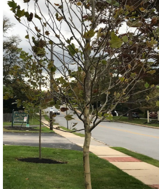
Sycamores on King St.