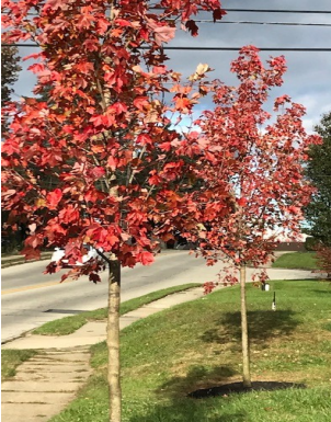
Red Maples on King St.