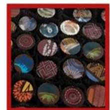
Chocolates by Christophers