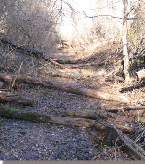
Obstructions along the Patriots Path trail bed

This Patriots Path Plan is designed to answer the following questions: