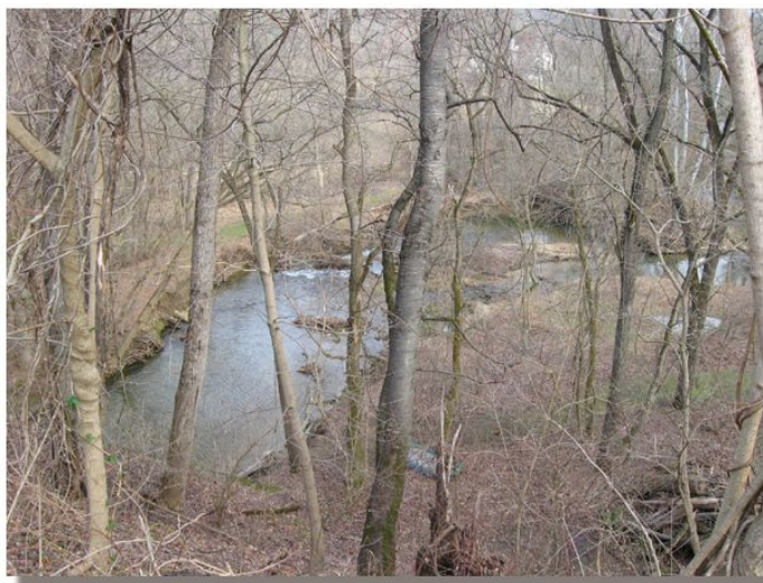
Trail crossing over Valley Creek

The portion of the Patriots Path network that will connect the Chester Valley Trail with Valley Forge National Historic Park extends through a highly developed part of Tredyffrin. Starting at the Chester Valley Trail on the south side of Route 202, the Patriots Path will make use of the interchange bridge that carries Chesterbrook Boulevard over Route 202. On the north side of Route 202, the trail will be built along existing and new sidewalk on Chesterbrook Boulevard in front of a hotel property. A short connection will tie the trail to Wilson Farm Park via Lee Road, which is bordered by a hotel and business park uses.