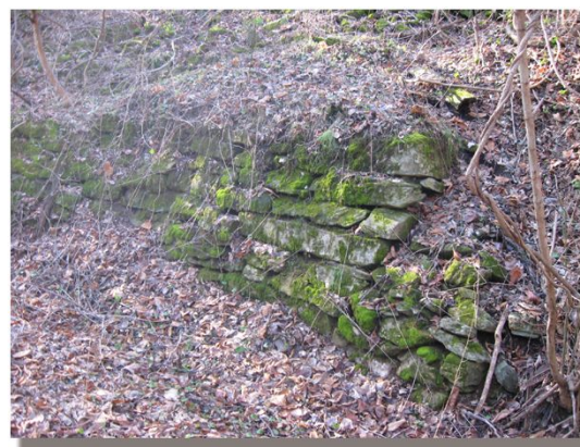
Man-made relics along the Patriots Path trail corridor

Trail Implementation – This chapter identifies the best ways to move the Patriots Path from plans to reality. Preliminary design and construction cost estimates, construction phasing, trail operations and maintenance costs, and trail stewardship responsibilities are the main topics discussed.