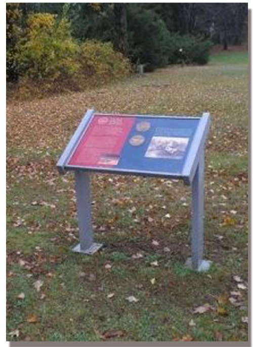
Marker on the Paoli Battlefield