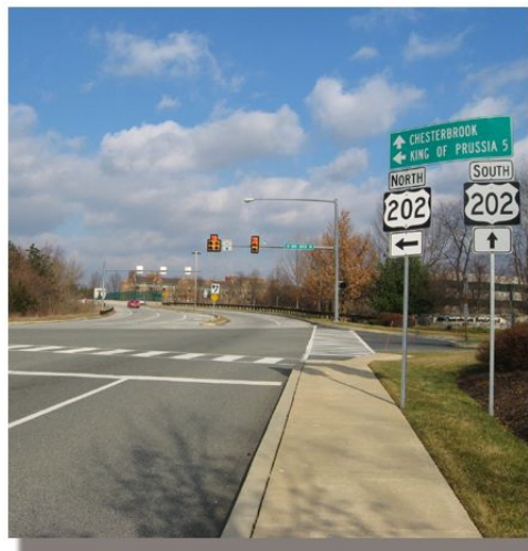
Chesterbrook Boulevard and Route 202

The Patriots Path will traverse a variety of local settings. Some segments of the trail will be in urbanized areas. Other parts will be adjacent to suburban neighborhoods or business parks. Certain segments will be along heavily traveled roadways. Others parts will cross streams, pass through dense woodlands and run through scenic countryside.