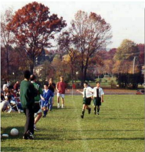
Soccer in East Whiteland Township

Battle of the Clouds Park (10.7 acres), an active recreation park on Phoenixville Pike, is the western terminus of the part of the Patriots Path that is evaluated in this plan. An undeveloped Great Valley School District property and a planned Township park currently known as the Swanenburg property (16.2 acres) lie just west of Battle of the Clouds Park adjacent to the Chester Valley Trail.