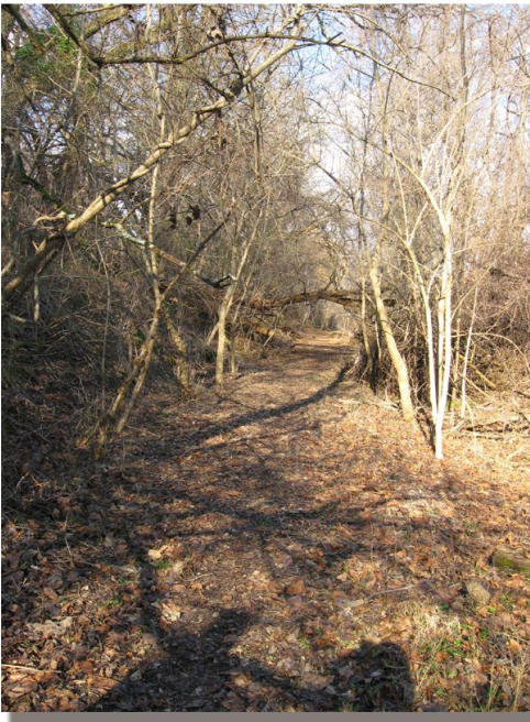
Along the Cedar Hollow Segment