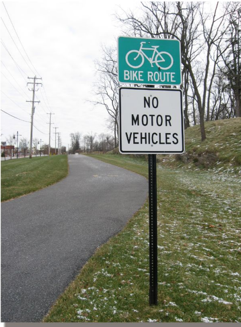
Chester Valley Trail in Exton

As already noted, the Chester Valley Trail is the east-west trunk line from which the other segments of the Patriots Path trail network will branch out. The portion of the Chester Valley Trail in East Whiteland Township and Tredyffrin Township is the part most immediately relevant to the Patriots Path. However, you need to look at the full extent of the Chester Valley Trail to understand how the Patriots Path will become part of a larger regional trail network.