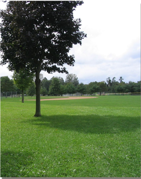
Louis D'Ambrosia Park

Cedar Hollow Road Park (24.1 acres) is an active recreation site on the Chester Valley Trail portion of the Patriots Path. It is situated at the point where the Patriots Path intersects with the Cedar Hollow Segment. Further eastward along this segment of the trail, Tredyffrin has a cluster of parklands situated within approximately \frac{1}{4} -mile of the trail. North of the trail, these include Mill Road Park, a 55.9-acre active recreation site, the undeveloped Duportail South Side Open Space (3.2 acres) and the undeveloped Swedesford Road open space (5.7 acres). Just south of the trail, these include the partially developed Radbill Park (18.0 acres) and the privately-owned Field of Dreams baseball park (15.7 acres). While these four recreation properties are not directly adjacent to the trail, they could be tied to it in the future with short pedestrian connections constructed along roadside rights-of-way.