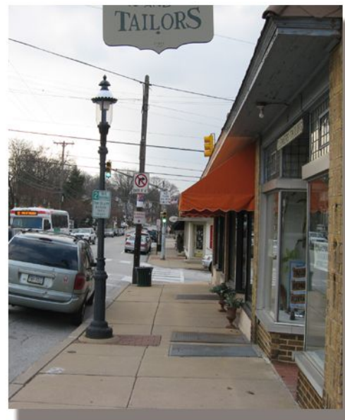
King Street in Malvern

The portion of the Patriots Path that is comprised of the Chester Valley Trail in Tredyffrin closely parallels Route 202. From west to east, this trail segment begins at the Tredyffrin/East Whiteland municipal border. Here, the trail passes through the wooded portion of the Vanguard Corporate Center tract before it runs alongside Township parkland and passes between Route 202 and several single family detached neighborhoods. It then traverses adjacent business parks before coming to Chesterbrook Boulevard. At Chesterbrook Boulevard, the Patriots Path will turn north to connect with Valley Forge National Historic Park (the portion of the trail to be known as the Valley Forge Segment). East of Chesterbrook Boulevard, the trail will continue as the Chester Valley Trail through Tredyffrin Township and into Montgomery County.