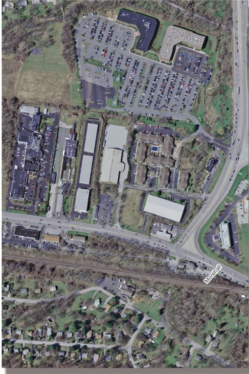
Route 29 and Route 30 intersection

In the vicinity of the Route 202/Route 29 interchange, the Patriots Path environment changes significantly. On the east side of Route 29, the Patriots Path runs adjacent to the large, high density Uptown Worthington mixed use development now under construction. The trail borders the Uptown Worthington and Great Valley Corporate Center from the east side of Route 29 to the East Whiteland/Tredyffrin municipal border.