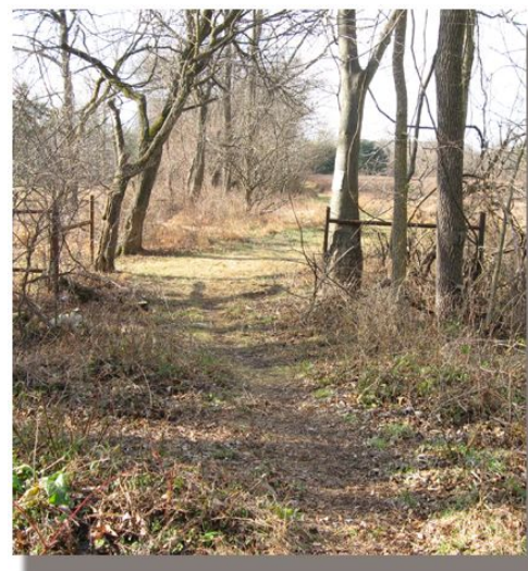
Cool Valley Preserve in Tredyffrin Township

On the north side of Route 202, the Cedar Hollow Segment abuts homeowner association lands that separate a residential neighborhood from Route 202. Further north approaching Swedesford Road, the Cedar Hollow Segment passes within approximately 1/10 of a mile of additional homeowner association property. On the north side of Swedesford Road, the Cedar Hollow Segment runs directly adjacent to Cool Valley Preserve (33.2 acres), which is owned by the Open Land Conservancy. At the northern tip of the Cedar Hollow Segment there are two interconnected Open Land Conservancy properties: Cedar Hollow Preserve (67.0 acres) and Miller Preserve (2.3 acres).